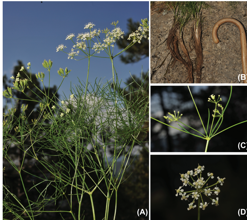
Figure 2. Rivasmartinezia cazorlana sp. nov. (A) habit, (B) detail of rhizomes, (C) base of the umbel showing the bracts, (D) flowering umbel.

diameter at flowering and 5–7 cm in diameter when fruiting, the lower-most of each branch often smaller and masculine; rays 5–7(–8), striate, unequal, 10–40 mm in flower and 23–45 mm in fruit; bracts (0–)1–4 (–5), deciduous, acicular, much shorter to almost as long as the rays. Partial umbels (umbellules) 7–15-flowered; pedicels (1.5–)2.0–5.0 mm at flowering and (2–)3–7 mm when fruiting; bracteoles (2–)3–6, persistent, narrowly linear, shorter or almost as long as the pedicels, with a narrow scarious margin in the lower third. Flowers epigynous, small, hermaphroditic or masculine; sepals 5, triangular, highly reduced; petals 5, homogeneous, 1.0–1.4 mm, obcordate with inflexed apex, white; stylopodium conical. Mericarps 4.5–6.0 × 1.2–1.5 mm, narrowly ellipsoidal, slightly compressed dorsally, glabrous, with 5 almost equal and narrowly winged primary ridges; styles ca 1 mm, patent or reflexed; vallecular and commissural vittae numerous (4–5 in each vallecule and 8–10 commissural), and additionally 0–1 near the apex of the ridges; seeds with endosperm slightly concave on the commissural side.