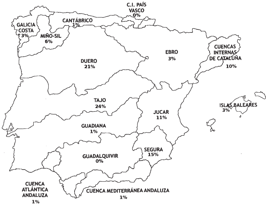
Fig. 1. Map of the different river basins in the Iberian Peninsula and Balearic Islands. The percentages show the number of references for each river basin.